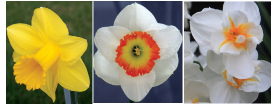
Arkle Roulette Sir Winston Churchill