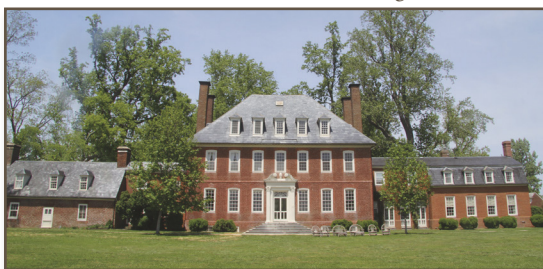
Westover Plantation, 2017 Fellowship site

Whether you are a graduate student looking for a special opportunity to further your knowledge and experience, or a GCV member interested in learning more about how the Garden Club of Virginia utilizes proceeds from Historic Garden Week in Virginia, there are many things to learn from this new fellowship website. Please see for yourself at www.gcvfellowship.org . 🌸