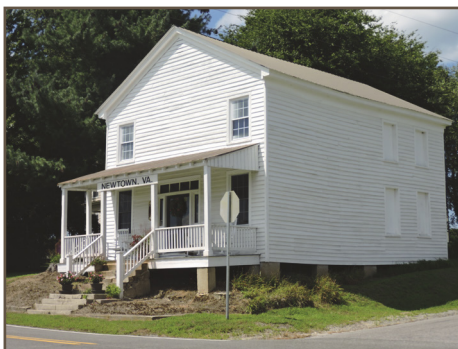
Newtown Post Office

This spring, homes in Newtown will be opened on Friday, April 28, 2017, during Historic Garden Week to welcome guests to revisit part of Virginia's past, conserved for the present and future. 🌸