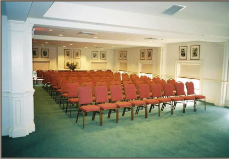
Flexible third floor can seat 75 theater style, 30 conference style or 24 classroom style.

Call (804) 643-4137 or email quanm@gcvirginia.org