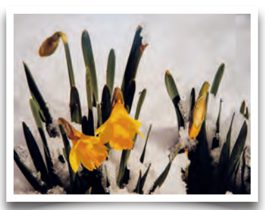
Wells Knierim Ribbon for Best Photograph in the Show, "Daffodils in a Landscape or Garden" Carolyn Noland Mill Mountain Garden Club