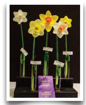
ADS Purple Ribbon Best Collection of five different standard daffodils Karen Cogar The Hunting Creek Garden Club