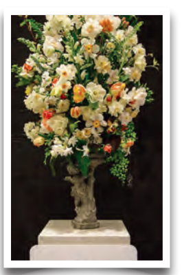
InterClub Class 247C Rococo "Francesco": Blue The Hampton Roads Garden Club