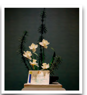
InterClub Class 247A Moribana "Selene": Blue The Rappahannock Valley Garden Club