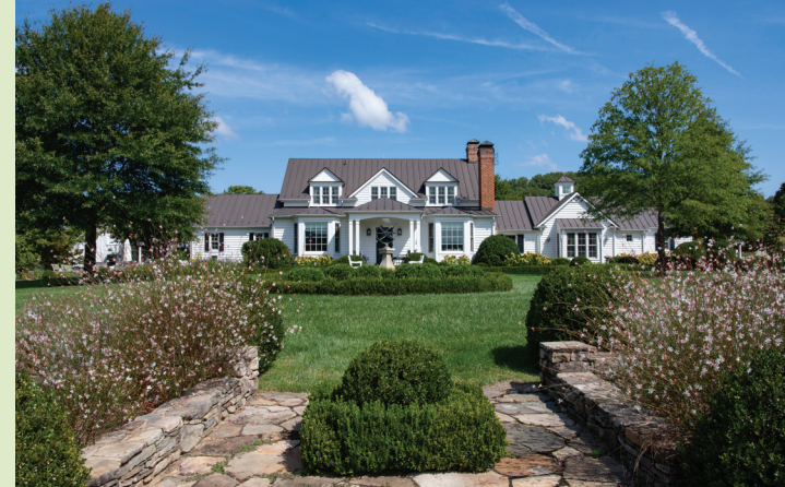
Above: Entrance of Lily Lane Gardens. Below: South African beaded birds decorate the Sparg Gardens.