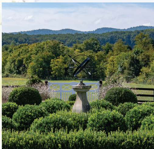
Lily Lane Gardens boxwood feature.

This driving tour winds through the backroads of western Albemarle County from Mint Springs to Bundoran in North Garden, showcasing a diversity of forests, pastures, and rolling hills. Visitors will enjoy a variety of gardens from beautiful formal spaces to curious gardener's gardens with a variety of themes. Miller School, established in 1878, sits on 1,100-acres and offers spectacular mountain vistas, a tour of three historical buildings and a working farm. Students from Miller School will demonstrate sustainable agriculture, farming practices, and land management at their campus vegetable garden and greenhouse. The nearby village of Crozet offers visitors a delightful respite with its mix of shopping, restaurants, and nearby wineries and breweries.