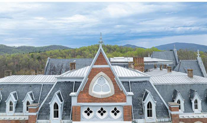
Gothic architecture details of Old Main.

Miller School, established in 1878, offers spectacular mountain vistas on an 1,100-acre property. Visitors may tour three historic buildings on the main campus and a second stop at the school's working farm. Students will demonstrate sustainable agriculture, regenerative farming practices, and land management related to animal husbandry. Miller's farmstead includes a vegetable garden, greenhouse, and kitchen for preparing agricultural products. The property is listed on the National Register of Historic Places.