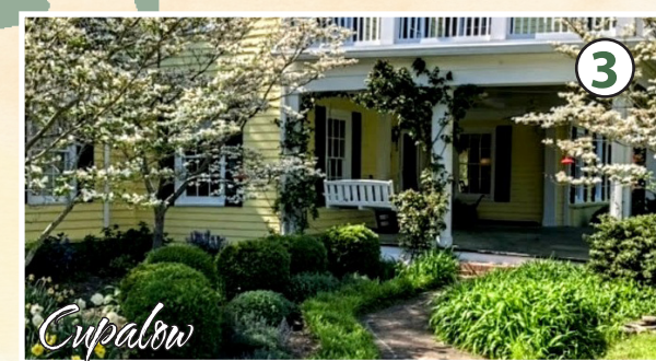
Cupalow 1273 North End Road, Deltaville, VA