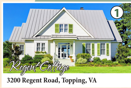
Regent Cottage 3200 Regent Road, Topping, VA

Nestled against the Chesapeake Bay, the Middle Peninsula is located between the Rappahannock and Piankatank Rivers and offers sweeping views along its 150 mile coastline. This tour, located in the peninsula's Middlesex County, features homes that both avid gardeners and historians will enjoy, Showcased properties include an 1867 farmhouse surrounded by well-loved gardens and an 1840 home filled with antiques. Another was completed in 1760 and includes extensive gardens as well as a replica of an 18th-century trading sloop docked there. The tour ticket includes three other nearby properties that architecturally blend land and sea for a total of six sites.