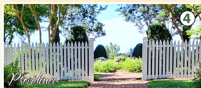
Providence Two Bland Point Drive, Deltaville, VA