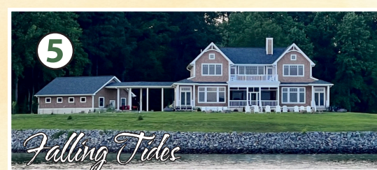
Falling Tides 119 Falling Tide Road, Deltaville, VA