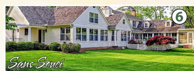
Sans Souci 630 Bland Point Road, Deltaville, VA