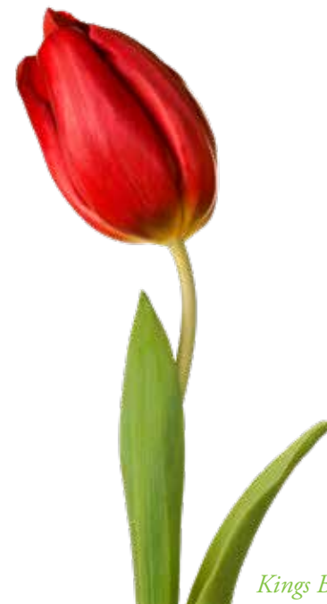
Kings Blood Tulip

PROCEEDS FUND THE RESTORATION OF VIRGINIA'S PUBLIC GARDENS AND A RESEARCH FELLOWSHIP PROGRAM